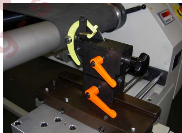
WSM 100 / WSM 100-B Cutting die