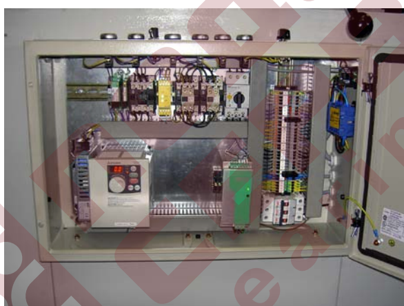
WSM 100 / WSM 100-B Wiring Cabinet