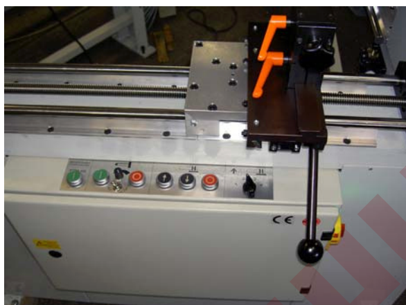
WSM 100 / WSM 100-B Control elements