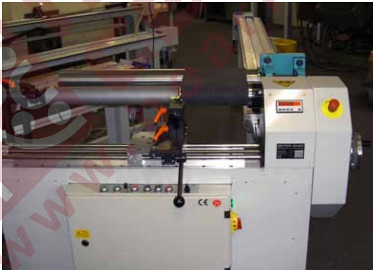
Complete view on WSM 100 / WSM 100-B